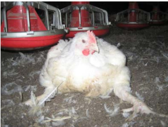
As a result of its accelerated growth rate, this chicken is unable to stand

A combination of accelerated growth rates and crowded living conditions often results in large numbers of birds dying prematurely. So great is the weight of their bodies, many chickens suffer from extreme leg and joint deformities, rendering them crippled. These birds are unable to access feed and water and die a slow death.