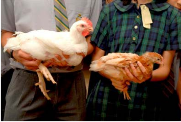
Comparison in size of a broiler chicken and a layer hen of same age of 38 days (Australian Chicken Meat Federation).