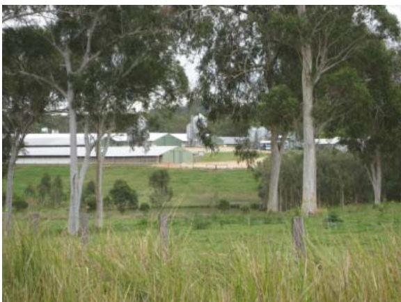
A typical broiler farm.

A typical, family-run broiler farm may house as many as 100,000 chickens and produce a total of 550,000 birds in a year. Every year in Australia more than 470 million chickens are raised and killed for their meat; these are known as broilers.