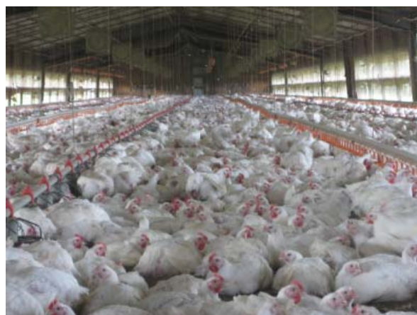
A typical Australian broiler shed

Due to the nature of the production system, birds are kept in the one shed for the entirety of their very short 5 – 7 week life. During this time, the birds' droppings are left to accumulate on the floor. As the chickens grow, the amount of ammonia in the air may increase. As the air becomes more polluted, dust, bacteria and fungal spores can become a health problem for both the birds and humans working in the sheds.