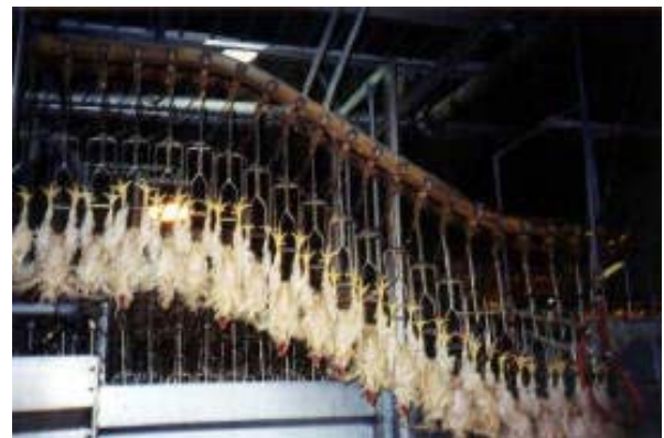
Chickens shackled to a conveyor belt before being stunned.

Once the chickens are unloaded at the slaughterhouse they are shackled to a conveyor belt which carries them down the processing line. The birds are carried along the line to an electrically charged water bath, which is meant to stun the birds before their throats are cut by an automatic knife. Unfortunately, some birds lift their heads and miss being stunned and go on to have their throats cut while they are still alive.