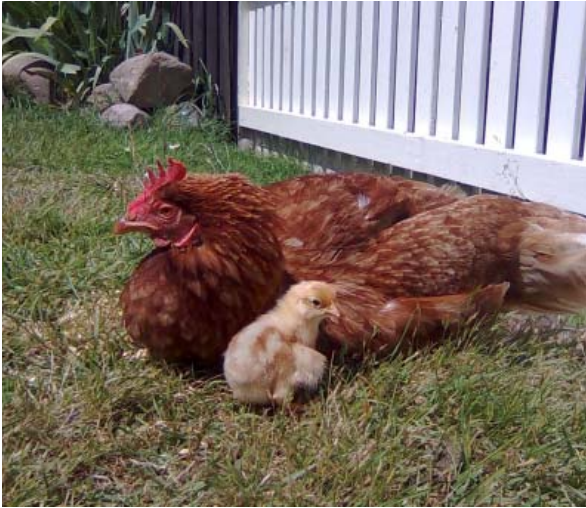
Ex-Battery Hen Margerita and 3 day old chick

In addition to the Ban Battery Hen Bill, AACT has also been pursuing the ban of the purchase of battery hen eggs by Government departments and agencies as well as local councils. So far, Hobart City Council, Clarence City Council and Launceston City Council have adopted bans, representing the first ever Australian municipal councils to make a stand against battery hen cruelty. On the Government front, Minister Llewellyn expressed support for a Government policy to the purchase of non-battery eggs but AACT is still awaiting an outcome of the Minister's approach to Government agencies asking them to change their purchasing policies.