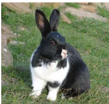
Teddy Rabbit at Big Ears Animal Sanctuary

The easiest way to help the animals is to stop eating them. A vegetarian or vegan diet not only saves lives, it is healthier for you and is friendly to the planet.