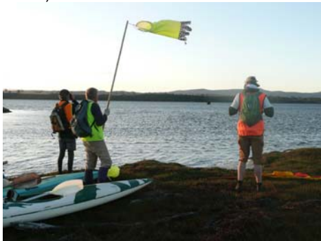
Duck Rescue weekend at Moulting Lagoon

March 7 & 8 was AACT's annual Duck Rescue Weekend. A number of activists attended the rescue (a very cold, wet and duckless weekend!).