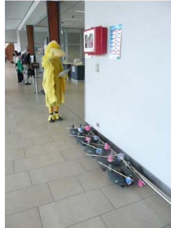
Ducks awaiting departure.

encouraging and supporting cruelty free living