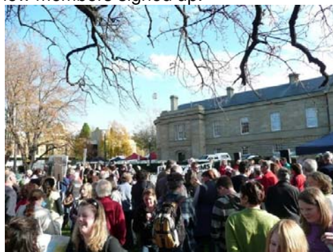
AACT Rally for the Animals

positive and hart warming with a number of people commenting that they had decided to go vegetarian after hearing the speakers. AACT also received a number of very generous donations as a result of the rally and a number of new members signed up.