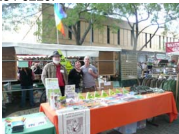
AACT Stall @ Salamanca Markets

The Greens Tasmania have very generously given AACT a fortnightly table at their Salamanca stall. This offers AACT the opportunity to regularly promote campaigns and to educate the public. This stall can only run if we have enough volunteers. If you are able to help us out, even for an hour or so, it would be greatly appreciated! To register to volunteer at this or any other event, please contact the AACT office on 6234 6229.