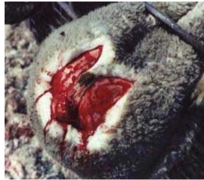
A Mulesed Sheep

Buy clothing from retailers that have pledged not to sell Australian merino wool products until mulesing and live exports have ended, such as American Eagle Outfitters, Abercrombie & Fitch, Timberland, Aéropostale, and Limited Brands.