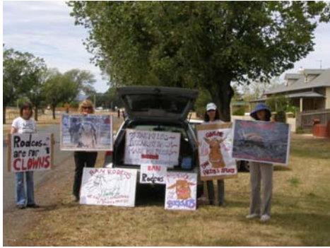
Ross Rodeo Protest

AACT held a massive Garage Sale on February 14 th and 15 th . We managed to raise almost $200. Thank you to everyone who very generously donated items for the sale and also donated their time.