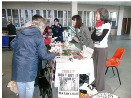
AACT stall at the Million Paws Walk