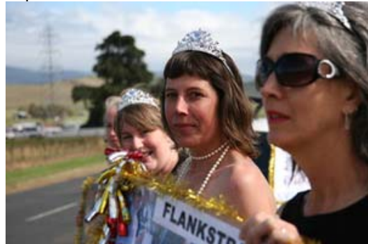
Tiara Protest at the Hamilton Rodeo

On Sunday March 29, a group of lovely ladies donned their cocktail frocks and tiaras and braved the cold in order to send the message that 'There is nothing glamorous about rodeos' and protested at the Hamilton Rodeo.