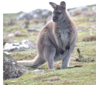
Bennetts Wallaby, Maria Island 2008