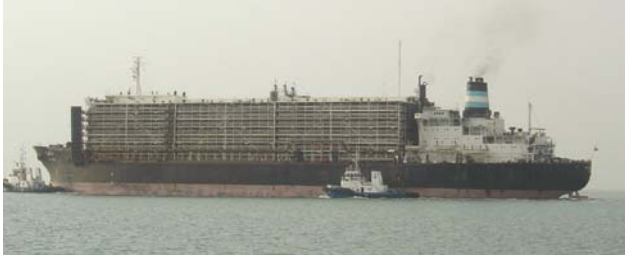
The M/V “Al Kuwait”

massive mortality event on the “ Becrux ” on its maiden voyage. The charges relate to a voyage in November 2003 on the “ Al Kuwait ”, a 30 year old ship, on which over 1,000 sheep died.